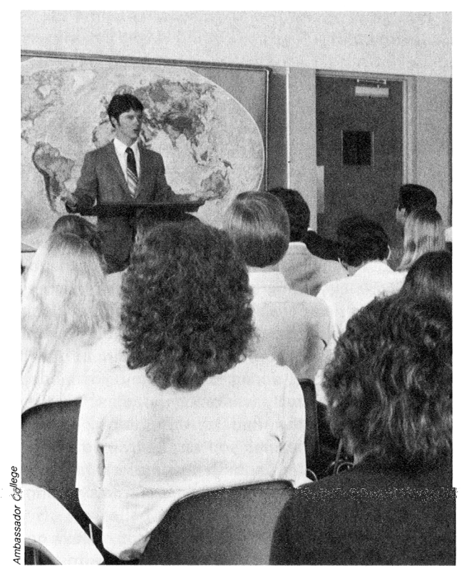
LEARNING TO RULE —The Christian life is like going to school to learn how to rule and teach.

Baptism and the laying on of hands of a minister of God for the receipt of the Holy Spirit also shows our recognition of, and submission to, the authority God has placed in the called and chosen ministers of His Church. And through the consequent begettal of God's Spirit, we become part of His govern-