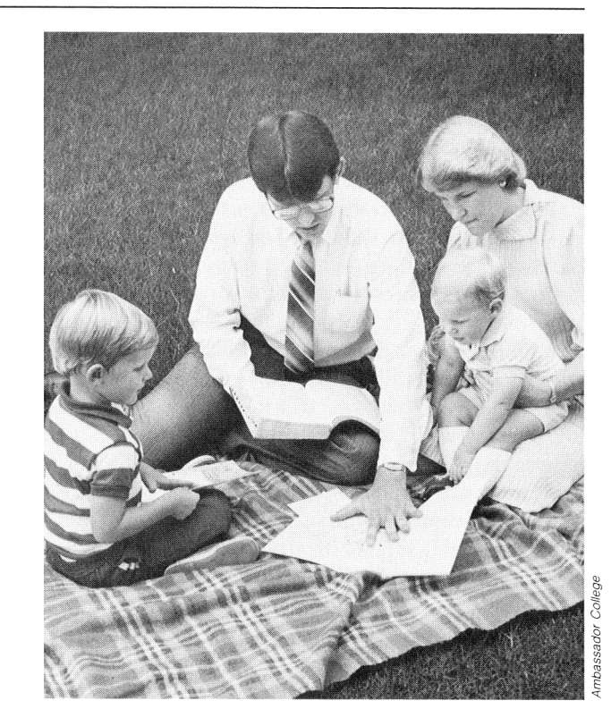
FAMILY BIBLE STUDY —The Sabbath is an excellent time to promote family togetherness by learning more about God, His great Law and the tremendous blessings He promises to those who obey Him.

COMMENT: The Sabbath is intended to free us