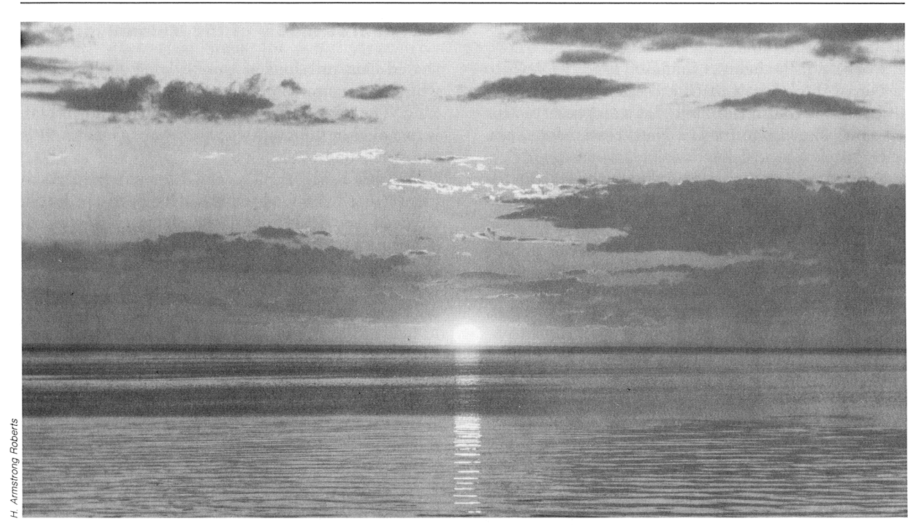
SUNSET every Friday evening marks the beginning of holy time—the beginning of God's Sabbath day. The people of God rejoice in the Sabbath because they know what a great blessing it is to keep it holy.

did not tell them to cease assembling on the Sabbath for worship!