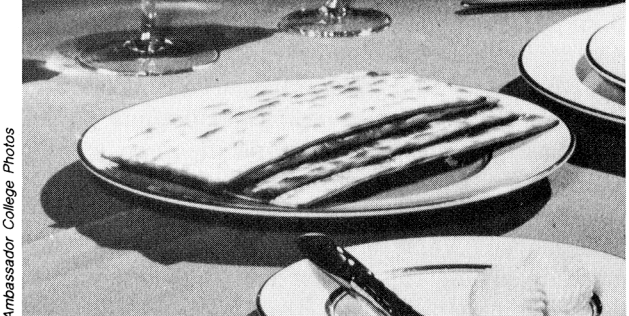
SYMBOLS —Leaven, a biblical symbol for sin, causes bread dough to become puffed up. Sin likewise puffs people up. Flat, or unleavened bread, pictures the absence of sin—obedience to God.

Christian's departure from sin. But why is this commemorated by seven days without leaven or leavened foods? We know that leaven itself is not harmful, for God allows it during the other 51 weeks of the year.