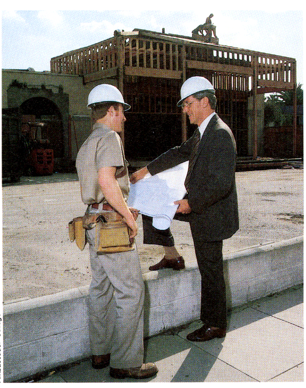
QUALIFYING TO RULE with Christ requires that we faithfully manage our own affairs today, no matter how small they may be.

will enter His Kingdom, for immortality is a gift from God. But it is our works that will qualify us for an office of responsibility—an opportunity for greater service, for doing more good—once we are born into God's ruling Family.