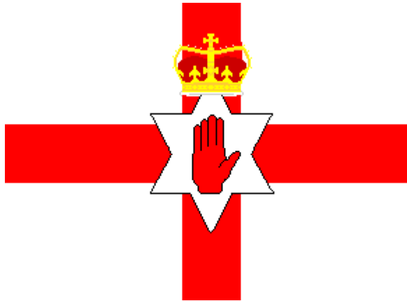
PHOTO CAPTION: The Flag of Northern Ireland combines the Star of David ( Pharez ) with the Red Hand ( Zerah ).

The Milesian Scots (i.e. Gaels ) who conquered the earlier inhabitants of Ireland (known as “ Tuatha-de-Danaan ”) were also known as the people of the “ Red Hand .” From time immemorial the people of Northern Ireland (Ulster) have used the “Red Hand” as an emblem of their heraldry. Even today, the official flag of Northern Ireland features a “ Red Hand ”: “The St. George’s Cross with the ancient regional emblem, the blood-red Right Hand of Ulster , at its center surmounted by the Royal Crown , forms the flag of Northern Ireland. A shield bearing the similar emblem...forms the flag of the Governor of Ireland” (Evans, The Observer’s Book of Flags , p. 28).