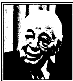
HERBERT W. ARMSTRONG

Appeared in the Los Angeles Times June 16, 1980