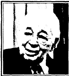
HERBERT W. ARMSTRONG

Appeared in the Los Angeles Times June 23, 1980