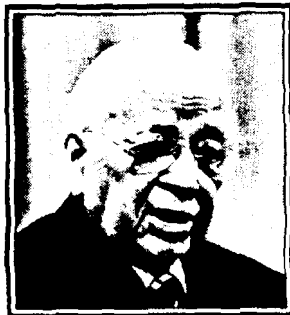
HERBERT W. ARMSTRONG

than twice the production per eight-hour day than others per nine-hour day. We pay $5 labor cost for the same production others receive for $7 labor cost—and our employees make $1.25 more per day for one hour less work."