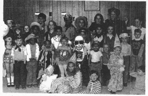
COSTUME PARTY - Children of the Montgomery, Ala., church pose in their fancy-dress costumes March 15. (See "Church Activities," page.)