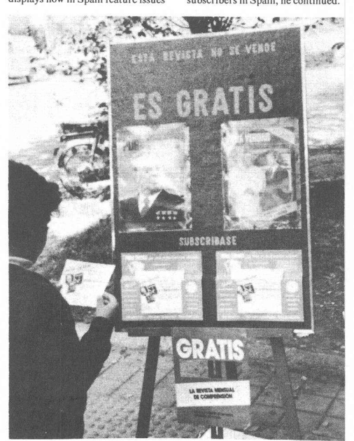
CIRCULATION TOOL — Above is a Pura Verdad (Spanish Plain Truth) easel cardholder used by brethren in Spain to increase circulation there.