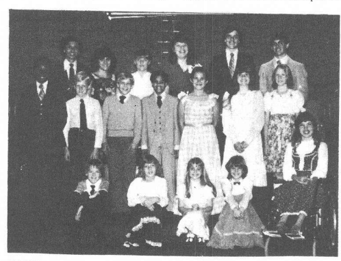
YOUTH RECITAL — Participants in the Garden Grove, Calif., church's youth recital March 6 take time out for a group picture. (See Activities," page 11.)