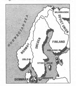
FRONT-LINE NATION - Norway's geographical position makes it the northern front line of NATO's defensive perimeter. [Map by Ron Grove]

Because of a remote border change in the Arctic region, Norway became a front-line state over-night. This was because a narrow