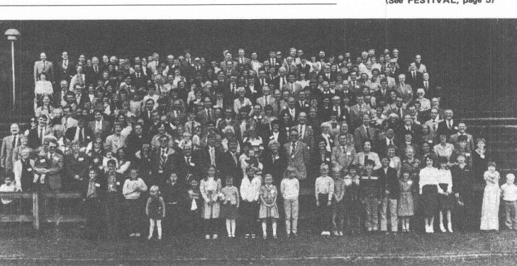
FEAST IN DENMARK - Most of the 292 people who attended the 1983 Feast of Tabernacles in Bredsten, ark, gather after one of the services at the Vingstedcentre sporting and conference center. The Feast will take place at the Vingstedcentre again in 1984.