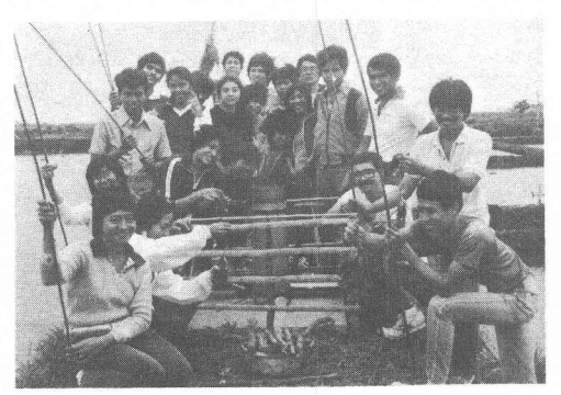
LADIES' EVENING — The Naga City, Philippines, Spokesman Club was host to a ladies' night Dec. 25.

DAY OF FISHING — A three-day singles' social in Tabaco, Philippines, featured an angling contest. Prizes were awarded to the first pair who caught fish