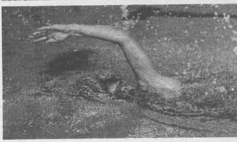
MAKE IT FUN — Choose from a variety of activities and plan an exercise program you will enjoy.