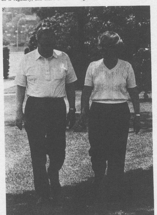
TAKE A WALK — Exercising with your spouse or a friend can provide incentive to continue your fitness program.

Start gradually, increasing the vigor and duration of the activity only as your fitness improves. Too much too soon can cause discour-