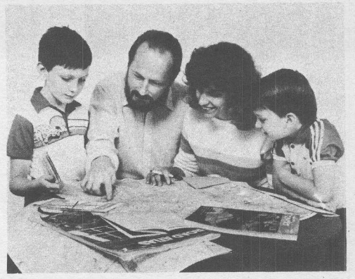
EXPANDING HORIZONS — Try widening your family's knowledge of world geography by locating each of the Church's Feast sites or places mentioned in the news on a globe or in an atlas.

In this age of mass communications there is no excuse for geographic illi-teracy. As Bible prophecy unfolds, prepare yourself to understand fully the climactic events that will soon engulf the earth