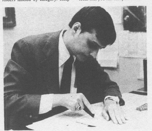
KEEP IT ON FILE - Clipping and filing newspaper and magazine articles ves you an easily accessed store of facts and ideas.

You'll be surprised at how much You libe surprised at now much you can collect in only six months! And soon, instead of looking at mounds of articles, clippings and other papers lying around, you'll have a valuable source of facts and ideas that you can easily refer to.