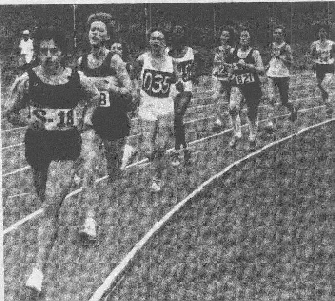
SENIOR GIRLS' 1500-METER RUN