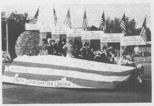
GRAND OLD FLAG — Flags represent seven eras of American history on the YOU float in the Arlington, Tex., Independence Day Parade. Below, the end of the float features a scene picturing the world tomorrow.