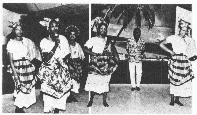
ISLAND NIGHT — Dressed in traditional silks, madrases and lace, Paris, France, brethren who originate from the French West Indies perform traditional dances and songs at a Jan. 5 social in Paris.