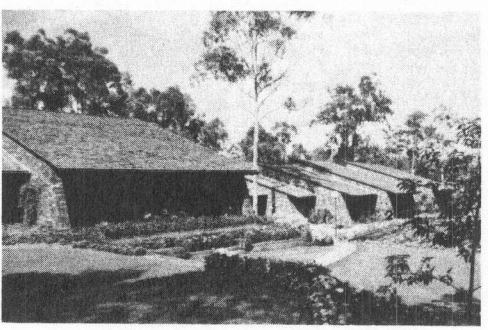
REGIONAL OFFICE IN BURLEIGH HEADS, AUSTRALIA