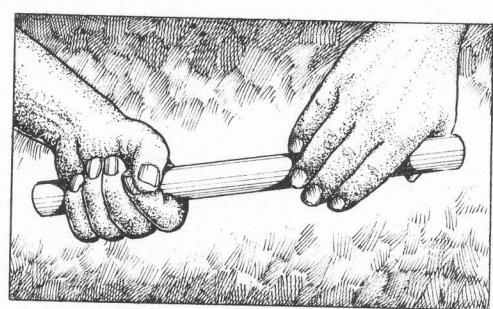
Artwork by Monte Wolverton

strong's foundation. Let's help him build a skyscraper to house the great harvest — let's help him build a tower of unity, not a tower of confusion.