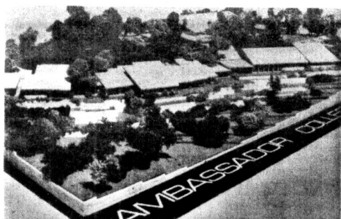
PROPOSED PLANT — Shown above are architect's models of the planned office facilities in Burleigh Heads, Australia.