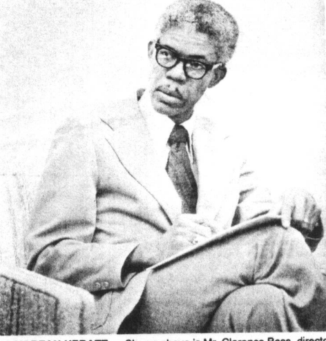
of the Caribbean Work, who filed the accompanying report on recent happenings in his area

You may wonder how the oil crisis could bring such quick action in economies which are basically agri-