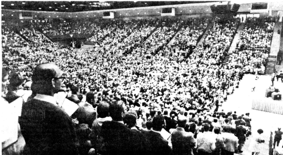
FEAST TIME — Feastgoers last year join in singing hymns at the Tucson, Ariz., Festival site. This year's Feast of Tabernacles will begin Monday night, Sept. 30, and end Tuesday night, Oct. 8.