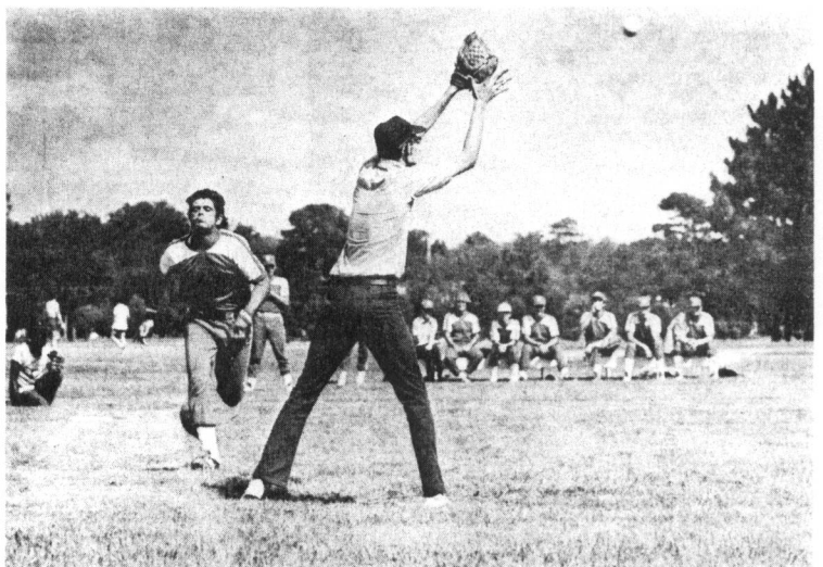
SOFTBALL TOURNEY — A member of a Houston (Tex.) East church softball team stretches to beat a throw to a Shreveport, La., first-baseman in a softball tournament held on the Big Sandy campus of Ambassador College Sept. 1. The Houston East team won the double-elimination tourney by defeating Houston West in the final. Shreveport placed third, while the host team, from Longview, Tex., failed to win a game.