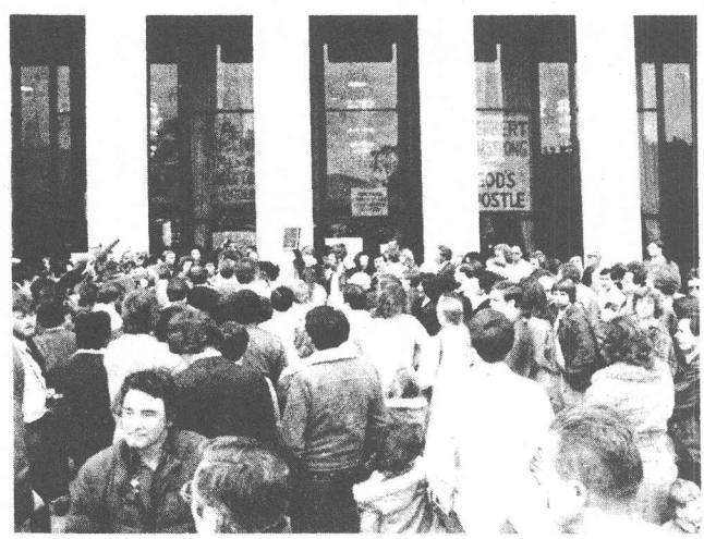
tatives crowd the plaza in front of the building to hear sessions piped in from the ministerial conference in Tucson, Ariz.