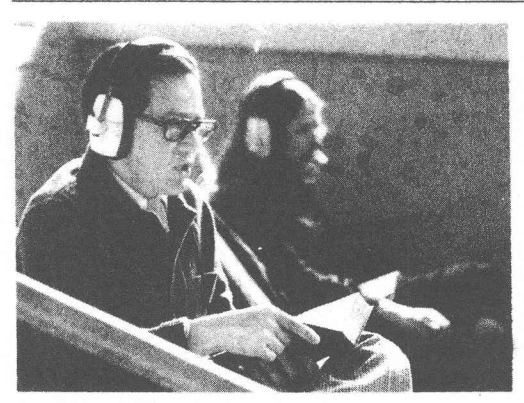
CONFERENCE TRANSLATOR - Translators simultaneously translate the messages of conference speakers from English to Spanish and French for the benefit of foreign ministers unfamiliar with the English language.