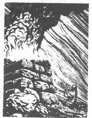
tous prophecies to be fulfilled in the end time, left, and The Bible Story, a six-volume series describing Old Testament stories such as Noah and the Flood, center and right.