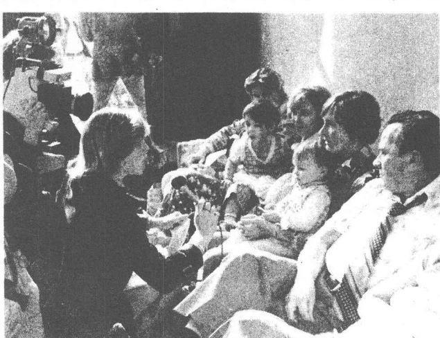
AREA MEMBERS — Above left: Area members participating in the sit-in take a break for lunch. Left: A television reporter, one of many on the scene through the three-day sit-in, interviews members in the Hall of Administration lobby. Right: Members and media representations of the control of the control of the control of the control of the control of the control of the control of the control of the control of the control of the control of the control of the control of the control of the control of the control of the control of the control of the control of the control of the control of the control of the control of the control of the control of the control of the control of the control of the control of the control of the control of the control of the control of the control of the control of the control of the control of the control of the control of the control of the control of the control of the control of the control of the control of the control of the control of the control of the control of the control of the control of the control of the control of the control of the control of the control of the control of the control of the control of the control of the control of the control of the control of the control of the control of the control of the control of the control of the control of the control of the control of the control of the control of the control of the control of the control of the control of the control of the control of the control of the control of the control of the control of the control of the control of the control of the control of the control of the control of the control of the control of the control of the control of the control of the control of the control of the control of the control of the control of the control of the control of the control of the control of the control of the control of the control of the control of the control of the control of the control of the control of the control of the control of the control of the control of the control of the control of the control o