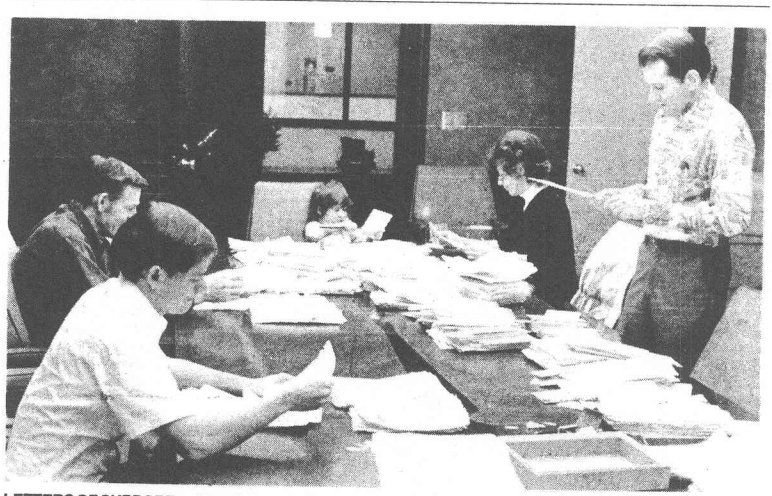
LETTERS OF SUPPORT — Church employees and other volunteers read letters sent in by members in response to a request that they voice their support of the Church's leadership during its present legal entanglement with the State of California.