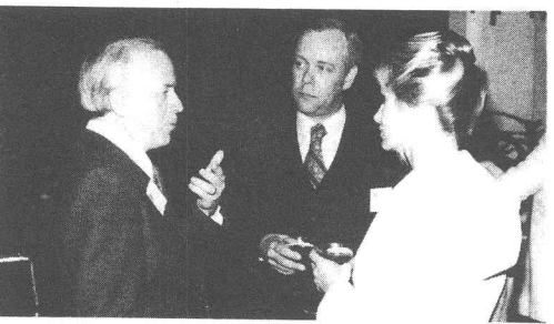
SOCIAL MIXER — Members of the Pasadena business community meet at the Chamber of Commerce Social Mixer held in the Ambassador College Student Center Feb. 28.

afforded us this opcial Mixer portunity. It cleared up a lot of mis-conceptions both internally and externally and provided a vehicle whereby the community is not only more aware of the Church and college but also became more supportive of our activities."