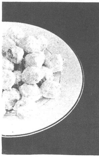
bleached; 4 t. sugar; 2 t. vanilla; 2 c. chopped nilla, alternately add nuts and flour; mix. Roll into et. Bake 300° for 45 min. Roll in powdered sugar Kochis, Matheson, Colo. Similar recipe by Sylvia