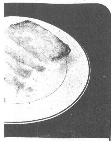
EESE BREAD ese; 1 c. flour; 1 t. salt; 3 eggs; 1½ c. milk; ½ c. edients together, then pour in greased pan. Bake in Pasadena Calif