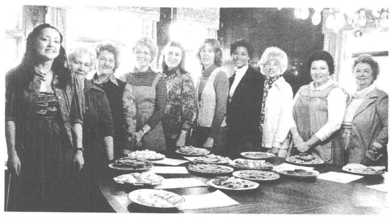
UNLEAVENED RECIPES — Members of the Ambassador Cultural Alliance, a women's club of the Pasadena churches, prepared some of the unleavened recipes sent in by Worldwide News readers. Photos of several of the dishes are shown on following pages.