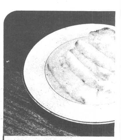
CHEESE BREAD 2 lb. longhorn cheese: 1/2 lb. lack cheese: 1 c. flour: butter, melted. Grate cheese. Mix all ingredients together 350° oven for 45 min. Yolanda Bailey, Pasadena, Calif.

NUTMEG COOKIE LOGS 3.c. flour; 1. nutmeg; 1.c. butter; 3/c. c. sugar; 1 egg; 2.t. vanilla; 2.t. rum flavoring. Froeting; 3.T. butter; 3/c. vanilla; 1.t. rum flavoring; 2/2 c. powdered sugar; 2 to 3.T. cream. Cream butter and sugar together, add egg, vanilla and rum and beat. Sift flour and nutmeg together and blend in. Shape into rolls ½-in. in diameter and 3.in long. Bake on ungressed. and 3 in. long. Bake on ungreased sheet at 350° for 12 to 15 min. Cool and frost. Sprinkle with additional nutmeg. Tonya Bryan, Big Sandy,