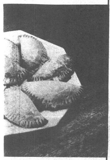
EAT TURNOVERS rown sugar; ½ c. butter, softened; ½ c. dairy c. flaked coconut; ½ c. raisina; ¼ c. chopped la; milk. Stir together flour, brown sugar and salt. crumbs. Add sour cream, mixing till ball forms ace, roll each portion into a 41/2-in, circle. Combine e 2 T. filling on each circle. Fold one side of dough sof fork. Bake on ungreased bäking sheet at 375° red, drizzle with powdered sugar, vanilla and milk