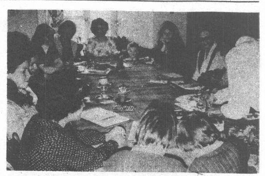
SWISS CLUB — The women of the German-speaking Ladies' Club of the Basel and Zuerich, Switzerland, churches watch with interest as a guest speaker demonstrates flower arranging for the home. (See Clubs," this page.)

The German-speaking Spokesman Club of the BASEL and ZUERICH, Switzerland, churches held its third meeting April 29 in the medieval town of Olten, founded in the 12th century by the Duke of Froburg near the river Aare. Club members gathered in the Rittersaal (Knights' Meeting Hall) in the castle