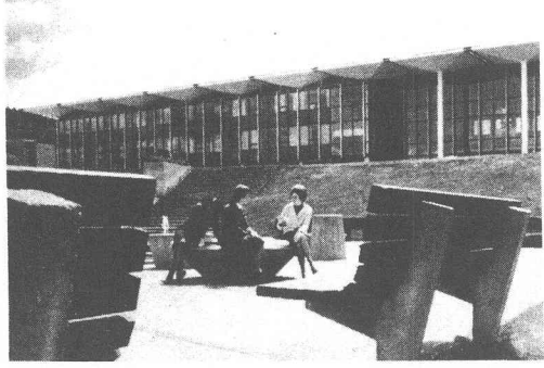
FRENCH-LANGUAGE SITE - The Cultural Center of the University of Sherbrooke will be the location for services at the French-language Sherbrooke, Que., Feast site. Translation services will be available for non-French-speaking members.