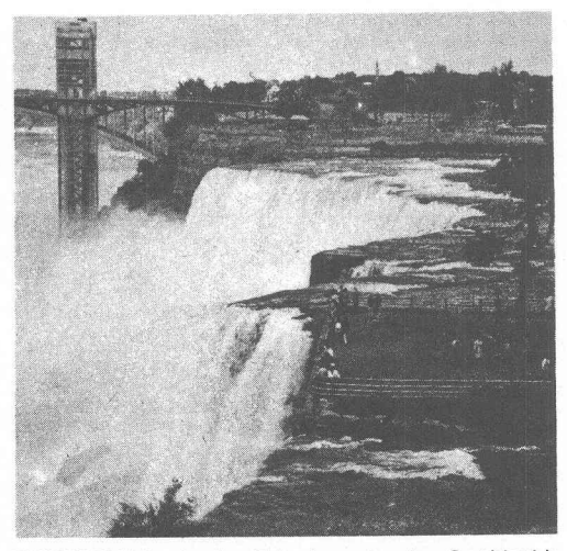
FAMOUS FALLS — American Falls, shown above from Goat Island, is part of Niagara Falls, a primary tourist attraction at Lewiston, N.Y., a Canadian Feast site.

Only minutes away from Niagara Falls, N.Y., this first-time Feast site will play host to 2,400 members. The