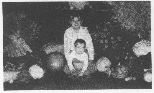
SPECIAL DECORATIONS - In-season decorations highlight Feast of Trumpets services in Grande Prairie, Alta. Four new members were baptized. (See "Holy Day Activities," this page.)

Vorel. SARNIA, Ont., brethren traveled to London, Ont., Nov. 3 for combined church services and a social. After the Sabbath services the London brethren (See CHURCH NEWS, page 9)