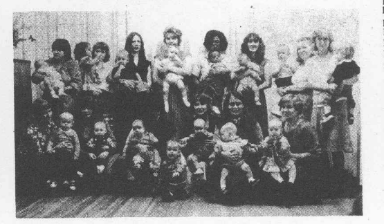
BABY BOOM - The Clarksburg, W.Va., church has literally borne much fruit in the last 18 months. Fifteen new additions have arrived in the congregation, which numbers slightly more than 200.