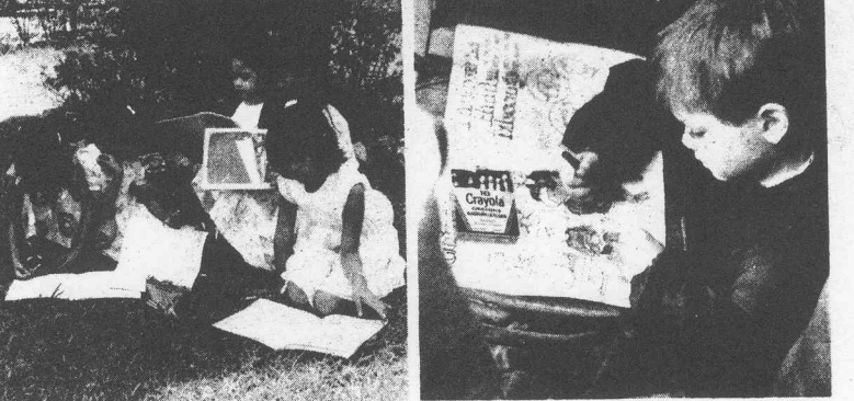
FEAST FUN BOOKS — Children at the Baguio City, Philippines, site, left, and at Prestatyn, Wales, make good use of the activity books distributed to children attending many Festival sites around the world during the 1979 Feast of Tabemacles.

Netherlands, Mexico, Israel, England, New Zealand, the Caribbean and the Philippines received the books, which were produced under