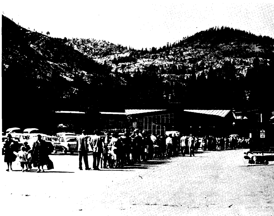
Cafeteria line outside Olympic Village. Notice beautiful, soaring peaks in the background.

physical health , keep filled with LOVE—and NEVER get bitter!