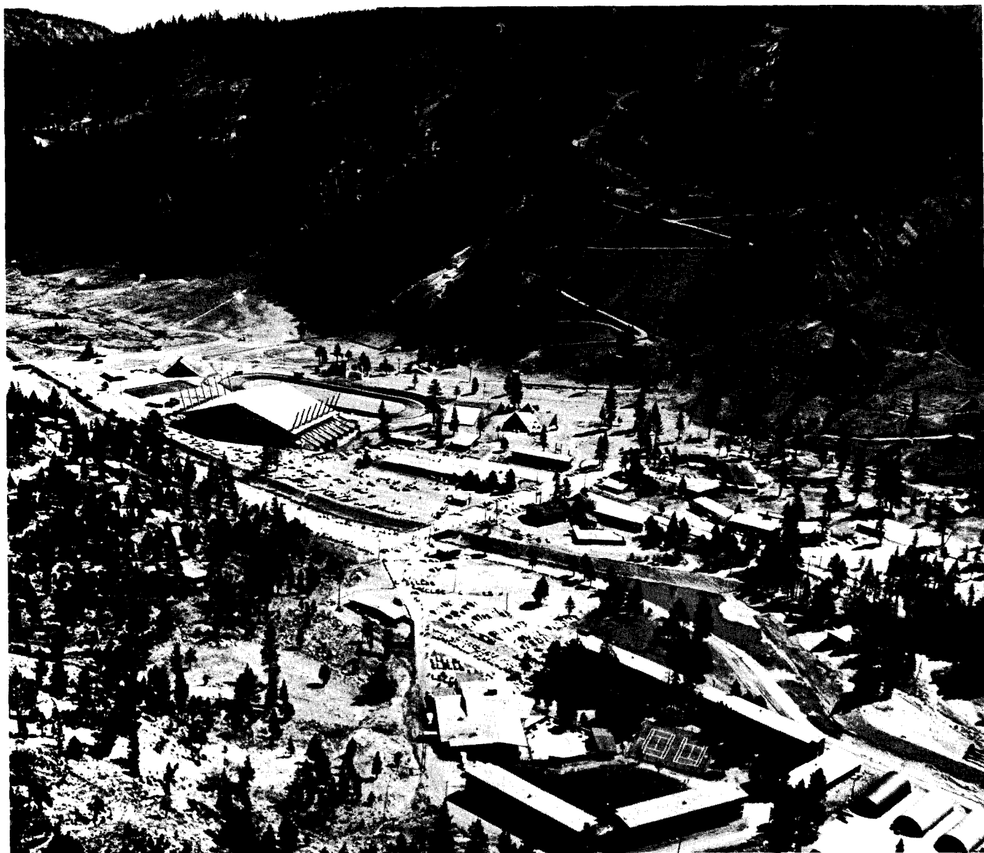
Marvelous aerial view of Squaw Valley. Blythe Arena, where services were held, is in left foreground with ski-jump just behind it on mountainside. Olympic Village and dormitories are seen at lower right.