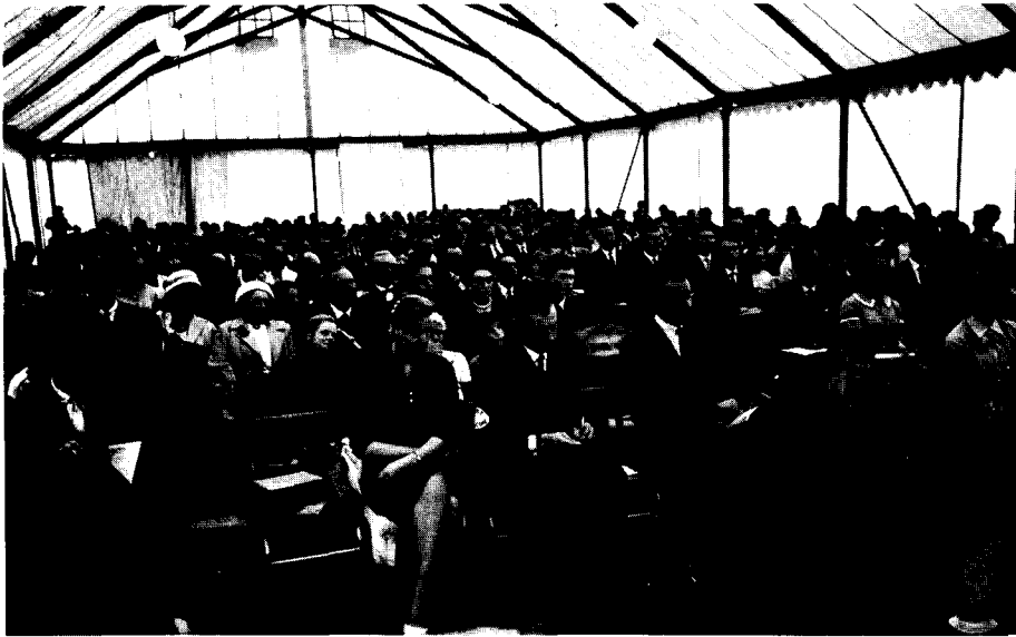
The Feast of Tabernacles in Europe—on our own Ambassador College grounds in England.

first Holy Day and 171 for the last Holy Day. Some of those attending both last year and this year came from distances near 3,000 miles, from the lower west side of the continent. Many came distances of from 600 to 1500 miles.