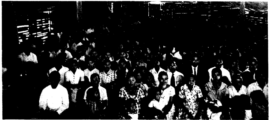
This picture was received in time for this issue but details of the Feast in the Philippines will appear next issue. We are overjoyed to report that 563 from six provinces attended—the third largest group —larger even than in Great Britain!