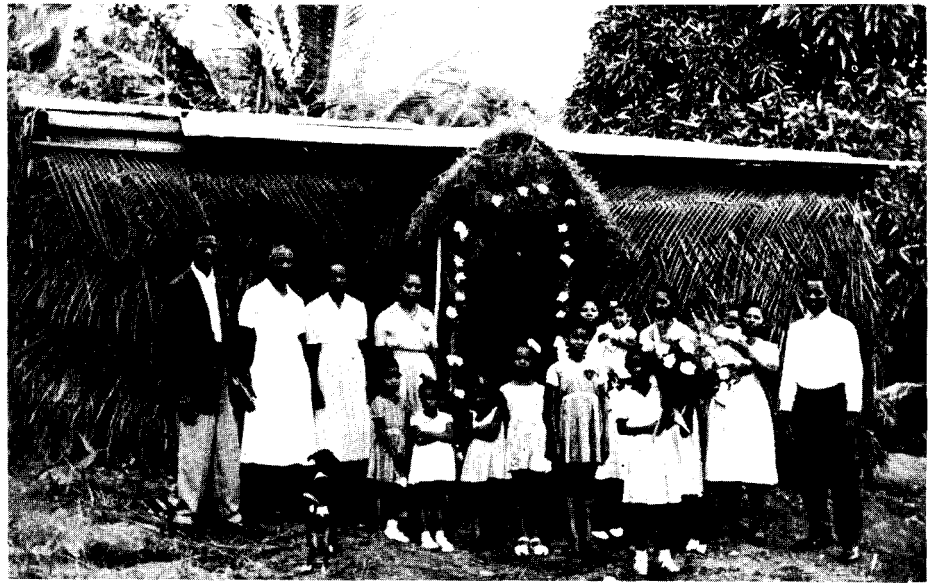
With the brethren in the West Indies. Here you see the temporary Tabernacle built especially for the occasion of the Feast—it's an outstanding work of art!

In just the past few weeks, five new churches have been established by this work of God!