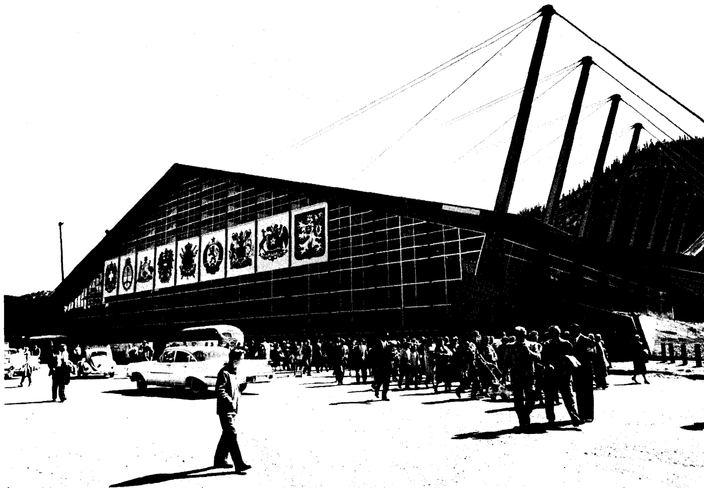
People emerging from Blythe Arena, at Squaw Valley, after services. Notice the striking design of this huge arena which won an architectural award.